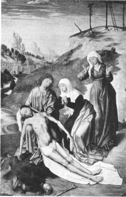
"PIETÀ" BY AN ANONYMOUS NORTH FRENCH MASTER, C. 1460. LENT BY MAX EPSTEIN (GALLERY 46)

the company of the restricted trecento works of the collection. Moreover, in a large museum, there might be several of these collections, walled off from the rest of the galleries and from each other, until one had the usual American museum, broken up into private memorial rooms alternating with more consistent rooms—the whole a confusing problem to the visitor. In one collection he would see a Cézanne; four galleries away (after he had forgotten all about this one) he might come upon four more. In one gallery were primitives; the next displayed nineteenth century works. The results were disastrous in several ways. The visitor lacked almost entirely the value of comparison. He could not put Mr. So-and-So's Cézanne against those in Mrs. So-and-So's bequest. Nor did he see, for example, Cézanne's relation to Pissarro and Derain's relation to Cézanne. The continuity of