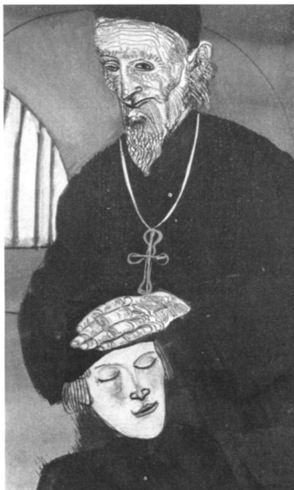
ILLUSTRATION FOR "THE BROTHERS KARAMAZOFF" BY BORIS GRIGORIEV. THE WINTER EXHIBITIONS

Contemporary painting in Paris is represented by a delightful group of paintings selected by The Robert Hull Fleming Museum, The University of Vermont, Burlington, Vermont. Almost all of the artists in the gallery are very young, some of them born as late as 1904, so that the exhibit will give an impression of just what is going on in the art capital under the enthusiasm of this generation. Included are