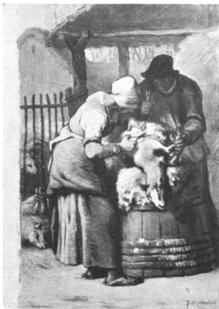
"THE SHEEP SHEARERS" BY JEAN FRANÇOIS MILLET, FRENCH, 1814-1875. THE POTTER PALMER COLLECTION. (GALLERY 25)