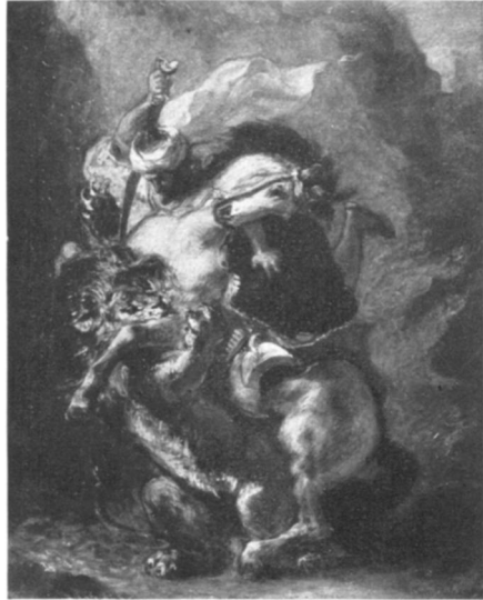
"ARAB RIDER ATTACKED BY A LION" BY EUGÈNE DELACROIX, FRENCH, 1798-1863. THE POTTER PALMER COLLECTION. (GALLERY 26)