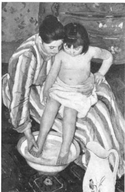
"THE TOILET" BY MARY CASSATT, AMERICAN, 1845-1926. THE FRIENDS OF AMERICAN ART, (GALLERY 41)