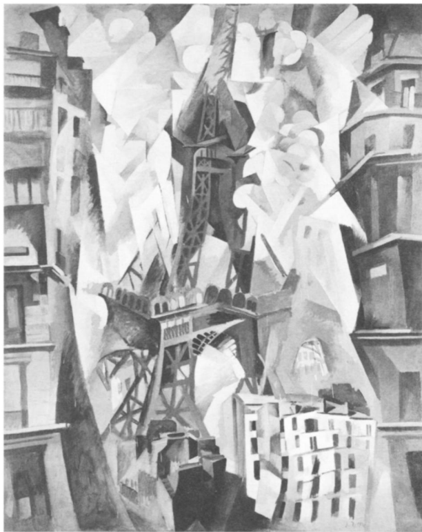
ROBERT DELAUNAY. Champs de Mars: The Red Tower , begun in 1911, reworked sometime before 1923 (pp. 142-43).