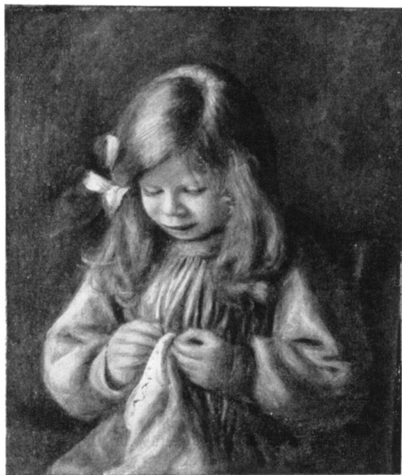
The Artist's Son Jean by Auguste Renoir. Size: 24 x 17½ inches (approximately size of original). Price: $10.00 unframed