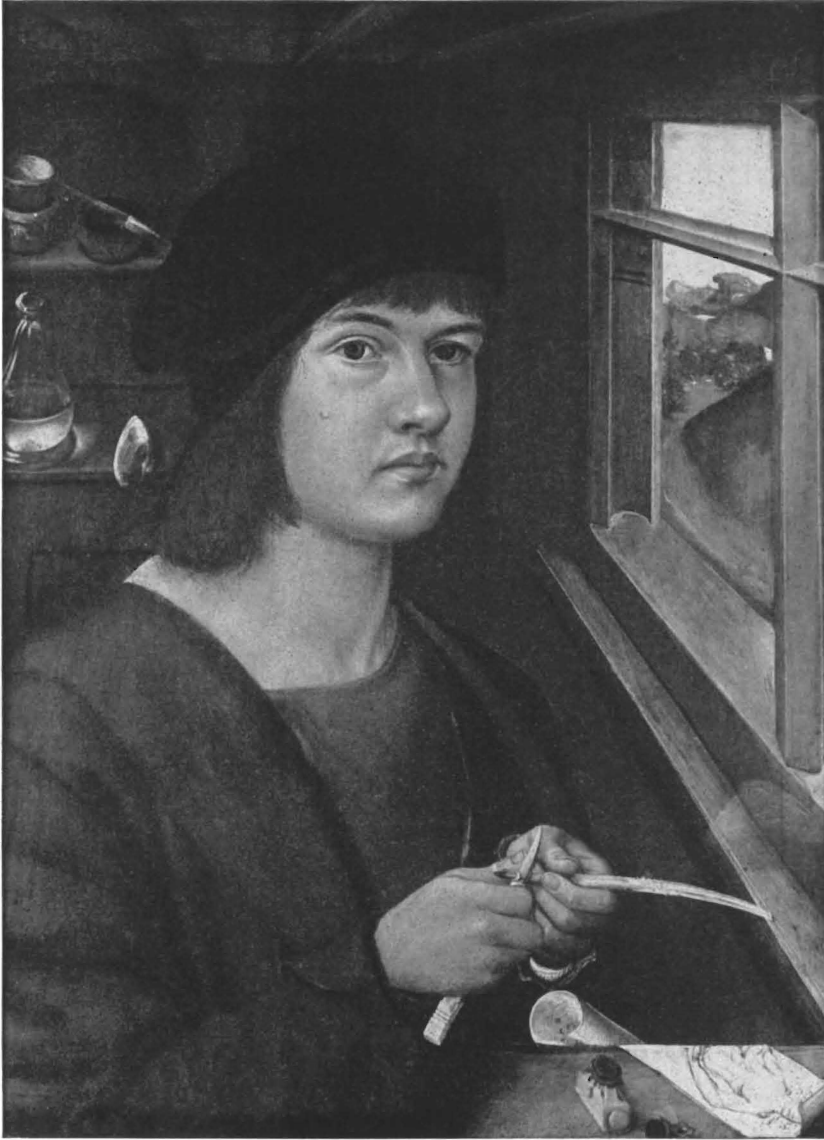
Portrait of a Young Painter by Mathias Grünewald. An extremely rare painting frequently attributed to the great German artist, Grünewald. This painter is very little known in the United States. The picture is probably dated somewhere in the late fifteenth century and is possibly a combination of both tempera and oil paint on panel.