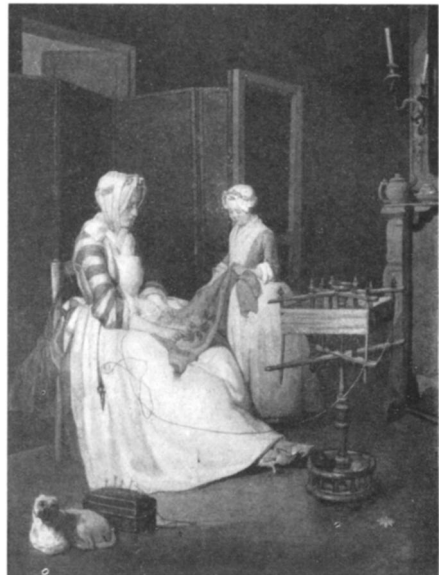
"THE INDUSTRIOUS MOTHER" BY CHARDIN (FRENCH, 1699-1779). LENT FROM A PRIVATE COLLECTION, NEW YORK