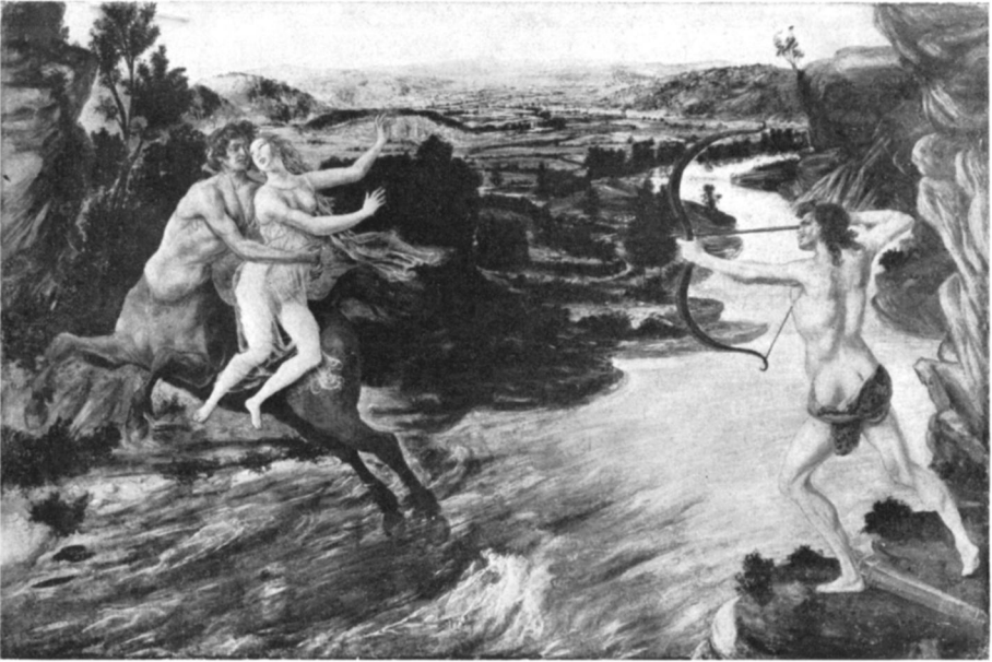
"RAPE OF DEIANIRA" BY ANTONIO POLLAIUOLO (FLORENTINE, 1432-1498). LENT BY YALE UNIVERSITY, SCHOOL OF FINE ARTS (JARVES COLLECTION)