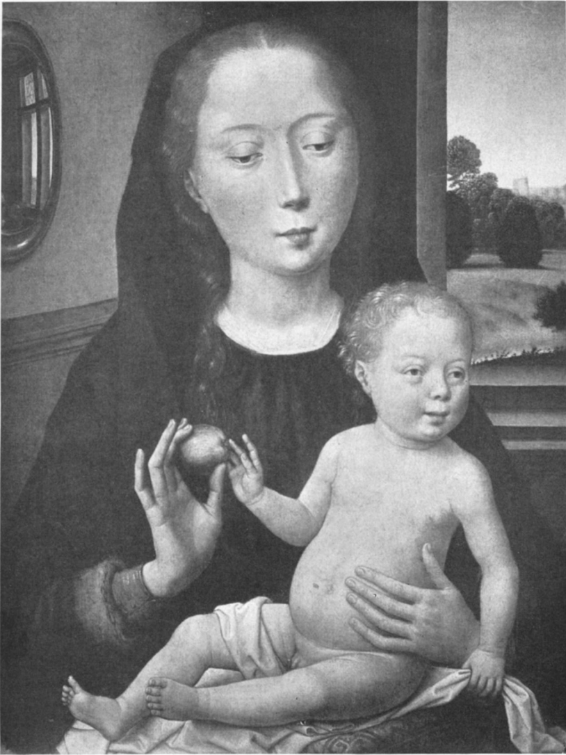
“MADONNA AND CHILD” BY HANS MEMLING (FLEMISH C. 1430-1494). OWNED BY THE ART INSTITUTE OF CHICAGO (THE MR. AND MRS. MARTIN A. RYERSON COLLECTION)