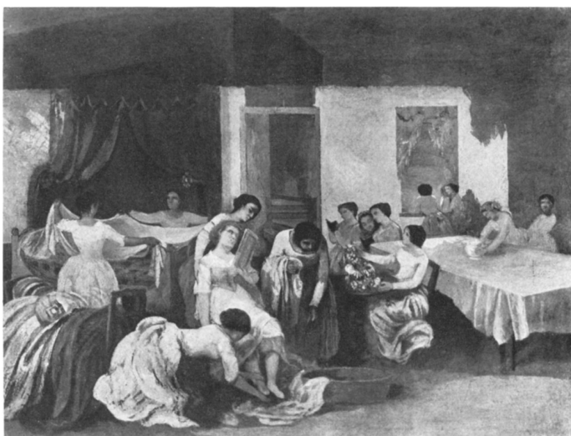
"TOILET OF A BRIDE" BY GUSTAVE COURBET (FRENCH 1819-1877) LENT BY SMITH COLLEGE MUSEUM OF ART