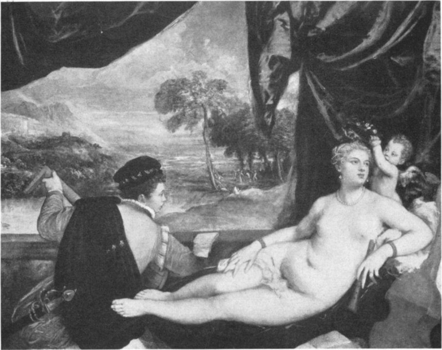
"VENUS AND THE LUTE PLAYER" BY TITIAN (VENETIAN, 1477-1576). LENT BY DUVEEN BROTHERS NEW YORK. THIS RECENTLY DISCOVERED WORK, AMONG THE MOST NOTABLE IN ALL OF THE ARTIST'S CAREER, WILL BE SHOWN IN THIS EXHIBITION FOR THE FIRST TIME