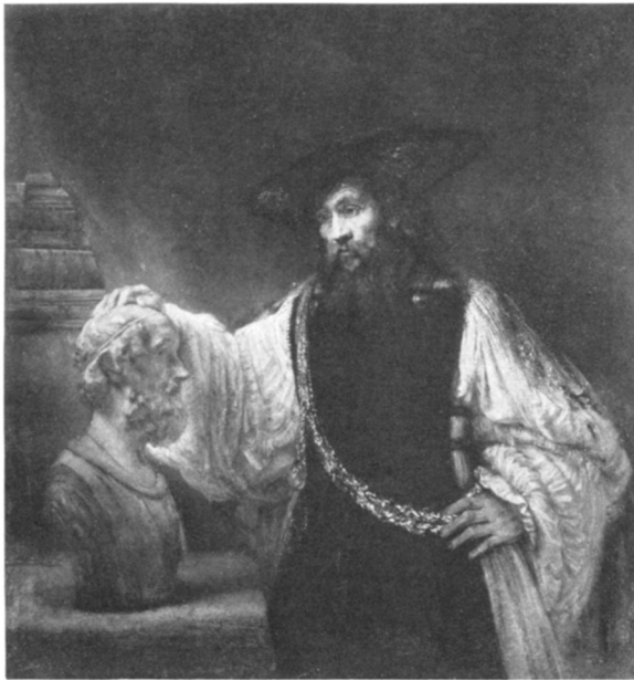
"ARISTOTLE" BY REMBRANDT (DUTCH, 1606-1669). LENT BY DUVEEN BROTHERS, NEW YORK