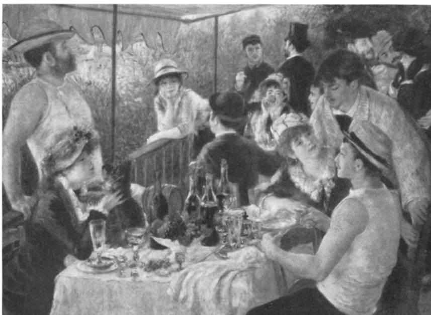
"THE CANOEISTS' BREAKFAST," BY AUGUSTE RENOIR (FRENCH, 1841-1919) LENT BY THE PHILLIPS MEMORIAL GALLERY, WASHINGTON, D.C.