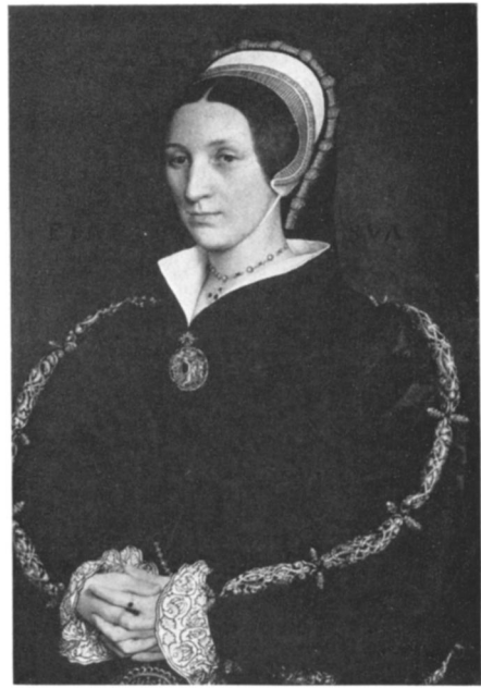
"CATHERINE HOWARD" BY HANS HOLBEIN THE YOUNGER (GERMAN 1497-1543). LENT BY THE TOLEDO MUSEUM (EDWARD DRUMMOND LIBBEY COLLECTION)

Ten paintings by El Greco are particularly appropriate, for, in certain ways, this great artist is the discovery of our own day. As late as 1905, the year in which the Institute acquired "The Assumption of the Virgin" (1577), El Greco's name was scarcely known; today he is rightly ranked with Titian, Rembrandt and Velasquez as one of the supreme artists of