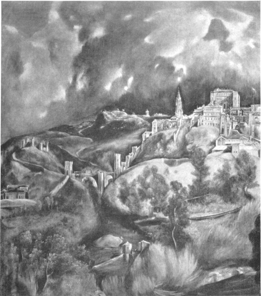
"VIEW OF TOLEDO" BY EL GRECO, (SPANISH, 1541-1614). LENT BY THE METROPOLITAN MUSEUM OF ART, NEW YORK