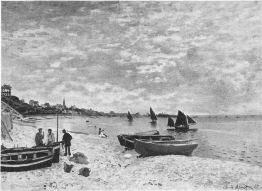
CLAUDE MONET, "THE BEACH AT SAINTE-ADRESSE" (1867). THE COBURN COLLECTION.