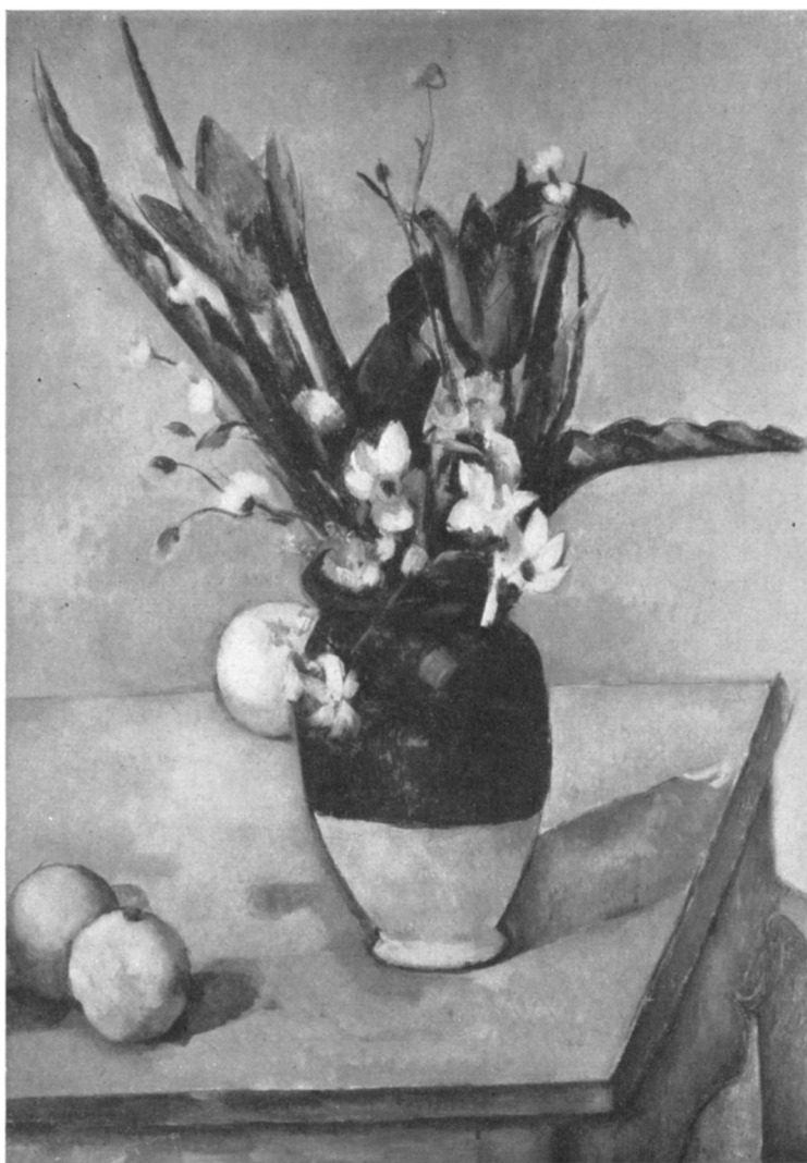
PAUL CÉZANNE, "FLOWERS AND FRUIT" (C. 1885). THE MR. AND MRS. LEWIS LARNED COBURN MEMORIAL