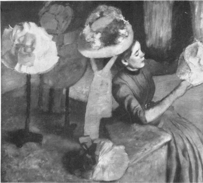
EDGARD DEGAS, "THE MILLINERY SHOP" (C. 1882). THE MR. AND MRS. LEWIS LARNED COBURN MEMORIAL.

times line, itself, is a little lost in an overlay of pigment. "The Dancer on the Stage," the third of the Coburn Degases, is what one has come to expect from this genius of the coulisses , but in "The Millinery Shop" we have a work in oil to compare with the greatest of his laundresses and café singers. In fact it is not too much to insist that this large canvas is among the finest later works by him. The subject was repeated often, oftener perhaps in pastel than in paint, but here there is no hint of the crayon. And here the hats themselves have conquered, and the figures have been reduced to one, a modiste, whose pose—a combination of angles and ovals—fits in perfectly with the subtle line scheme. One could