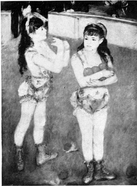
IN THE CIRCUS—PAINTING BY RENOIR IN POTTER PALMER COLLECTION

of great importance in the American art museum. The Art Institute of Chicago through its many gifts and loans of French paintings now affords admirable opportunities for knowing at first hand the versatility of French painting of the nineteenth century and the richness of its contribution to art. Enough time has now elapsed since the acquisition of French paintings was the fashion for opinions and valuations to become crystallized and for each painter to be recognized for his real worth. Cazin and Dagnan-Bouveret, for example, were more in favor than were Monet and the impressionists at the time the Potter Palmers were making their collection, but the tonalists were afterward neglected when the impressionists came into their own. Now, the spiritual qualities in the work of these two painters are recognized, and even though their goal was different from that of the impressionists, they have taken their place among the French immortals.