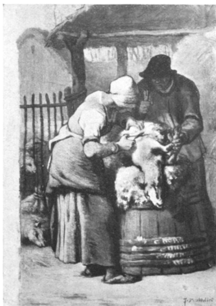
"THE SHEEP SHEARERS" BY JEAN FRANÇOIS MILLET, FRENCH, 1814-1875. THE POTTER PALMER COLLECTION. (GALLERY 25)