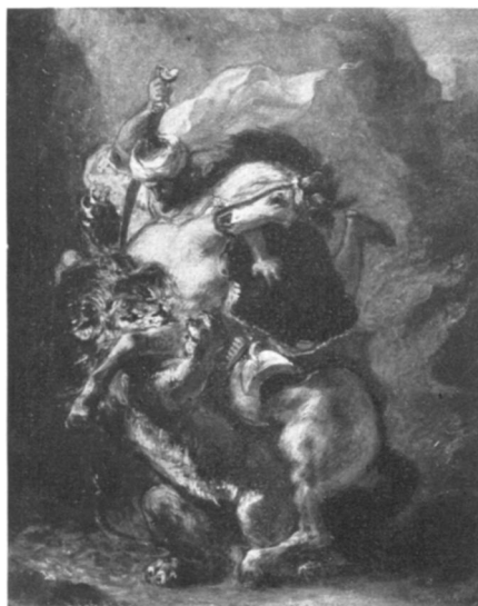
"ARAB RIDER ATTACKED BY A LION" BY EUGÈNE DELACROIX, FRENCH, 1798-1863. THE POTTER PALMER COLLECTION. (GALLERY 26)