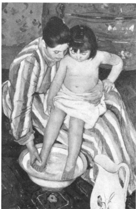
"THE TOILET" BY MARY CASSATT, AMERICAN, 1845-1926. THE FRIENDS OF AMERICAN ART, (GALLERY 41)