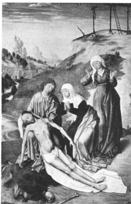
"PIETÀ" BY AN ANONYMOUS NORTH FRENCH MASTER, C. 1460. LENT BY MAX EPSTEIN (GALLERY 46)

the company of the restricted trecento works of the collection. Moreover, in a large museum, there might be several of these collections, walled off from the rest of the galleries and from each other, until one had the usual American museum, broken up into private memorial rooms alternating with more consistent rooms—the whole a confusing problem to the visitor. In one collection he would see a Cézanne; four galleries away (after he had forgotten all about this one) he might come upon four more. In one gallery were primitives; the next displayed nineteenth century works. The results were disastrous in several ways. The visitor lacked almost entirely the value of comparison. He could not put Mr. So-and-So's Cézanne against those in Mrs. So-and-So's bequest. Nor did he see, for example, Cézanne's relation to Pissarro and Derain's relation to Cézanne. The continuity of