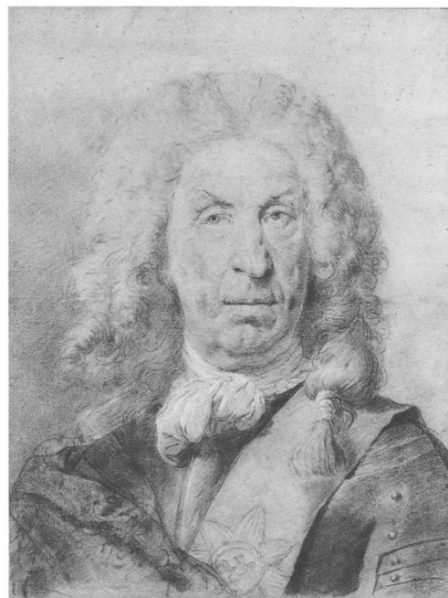
FIGURE 5. Giovanni Battista Piazzetta (Italian, 1682–1754). Portrait of Marshal von der Schulenburg , 1731. Black chalk and charcoal with stumping, heightened with touches of white chalk, on blue-gray laid paper (discolored to cream), laid down on wood pulp board; 506 x 385 mm (19 7 / 8 x 15 1 / 8 in.). Helen Regenstein Collection (1971.325).

By contrast, the exotic imagination and heightened color of Eugène Delacroix's oeuvre is captured in a jewel-like painting on paper, The Turkish Rider (fig. 6), while the humor and shrewd political insight of Honoré Daumier is epitomized in Three Judges . 13 While multiple examples of the work of Delacroix and Daumier are to be found in the Regenstein Collection, it represents nineteenth-century art in breadth as well as in depth. This variety can be seen in the collection's remarkably different drawings by Edouard Manet; an early, severe treatment of the female nude in red chalk 14 contrasts vividly with a later, sympathetic watercolor of his friend, pupil, and future sister-in-law, Berthe Morisot (fig. 7). Two years later, in 1965, Joachim and Helen Regenstein added Berthe Morisot's own probing, late self-portrait pastel to the collection. 15