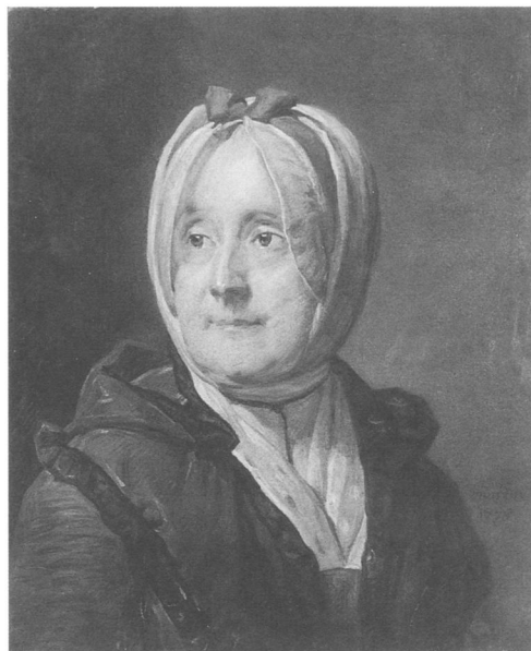
FIGURE 3. Jean Siméon Chardin (French, 1699–1779). Portrait of Madame Chardin , 1776. Pastel on paper; 455 × 375 mm (17 7 / 8 × 14 3 / 4 in.). Helen Regenstein Collection (1962.137).

During the late 1950s and early 1960s, the approach to collecting and the funds available to New York institutions were quite different from those of the Art Institute. Most of the eighteenth-century French drawings purchased in these years by The Metropolitan Museum of Art and the Pierpont Morgan Library, for instance, were interesting drawings by minor artists, or lesser drawings by major figures. The collecting styles of the Metropolitan Museum and the Morgan Library may have been guided by the